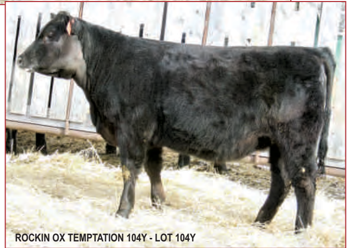
ROCKIN OX TEMPTATION 104Y - LOT 104Y