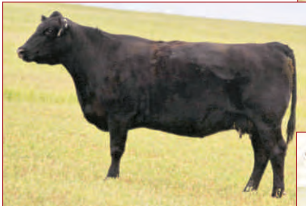
EASTONDALE ENCHANTRESS 54'05 DAM OF LOT 68Y