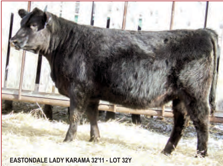
EASTONDALE LADY KARAMA 32'11 - LOT 32Y

HYLINE RIGHT TIME 338 AMF NHF CAF N BAR EMULATION EXT AMF NHF CAF HYLINE RIGHT WAY 781 AMF NHF CAF LEACHMAN RIGHT TIME AMF HYLINE ELLEN 86 LEACHMAN ERICA 0025 S: EASTONDALE BREAK AWAY 32'07 D: BEVERLY HILLS BLACKBIRD 303 G D A R ROYCE 131 V D A R NEW TREND 315 AMF NHF CAF GDAR FOREVER LADY 9136 BIG SKY BLACKBIRD 264 G D A R FOREVER LADY 223 GENEL BLACKBIRD REVOLUTION 10U