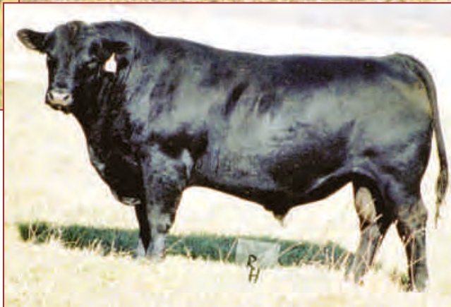
GEIS MAXIMUM 80'01 SIRE OF LOT 68Y