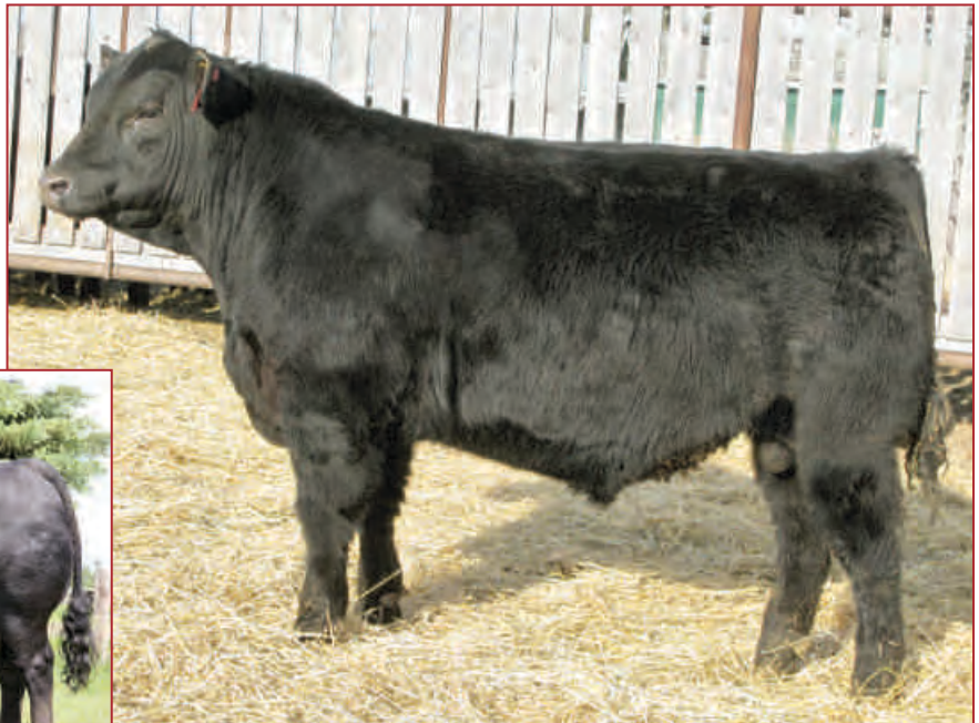
ROCKIN OX SNEEKY PETE 103Y - LOT 103Y