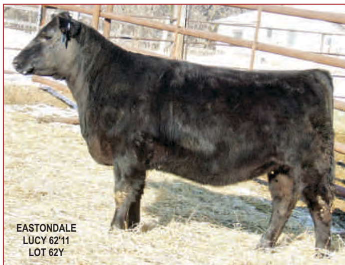
EASTONDALE LUCY 62'11 LOT 62Y