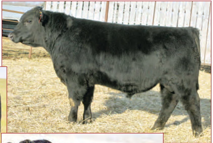
ROCKIN OX MAXED OUT 68Y LOT 68Y