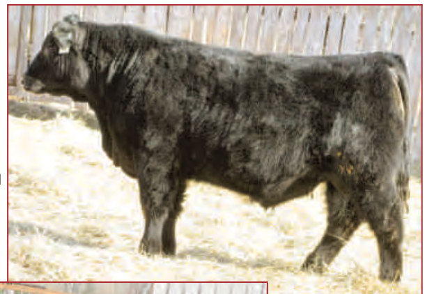
EASTONDALE TRADITION 92'11 LOT 92Y