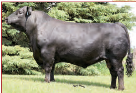
EASTONDALE BREAK AWAY 32'07 - SIRE OF LOT 103Y