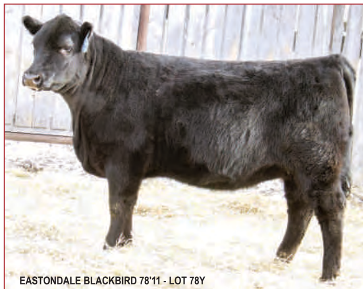
EASTONDALE BLACKBIRD 78'11 - LOT 78Y