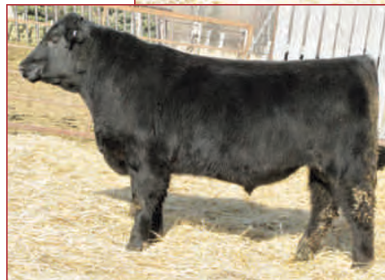
EASTONDALE TRADITION 112'11 LOT 112Y