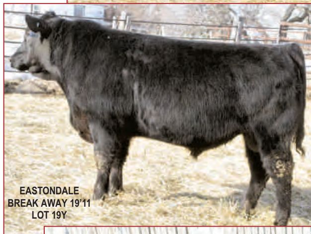
EASTONDALE BREAK AWAY 19'11 LOT 19Y