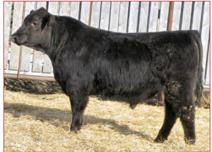
EASTONDALE DURATION 27'11 - LOT 27Y