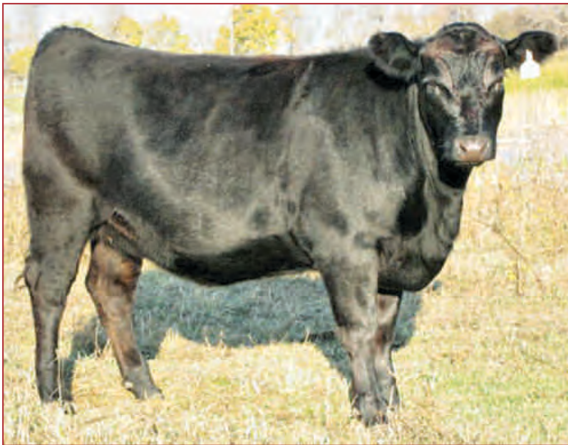
TYPICAL EASTONDALE RIGHT TIME 62'03 DAUGHTER