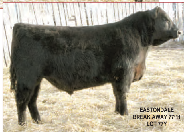
EASTONDALE BREAK AWAY 77'11 LOT 77Y