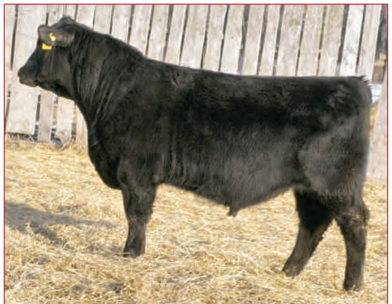
OAKWOOD RIGHT TIME 3Y - LOT 3Y