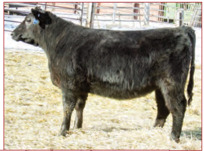
EASTONDALE SANDA ROSE 96'11 LOT 96Y