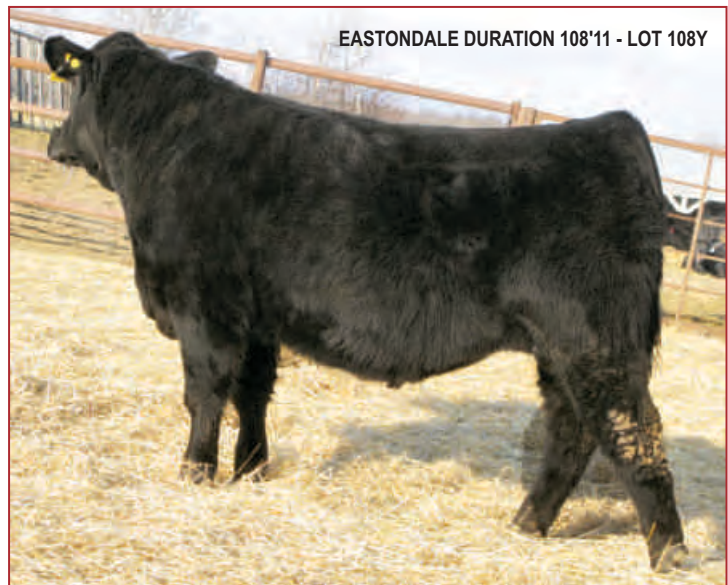
EASTONDALE DURATION 108'11 - LOT 108Y