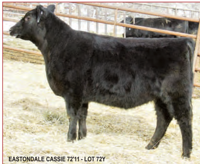
EASTONDALE CASSIE 72'11 - LOT 72Y