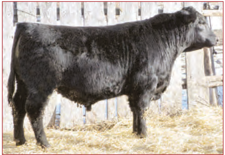
EASTONDALE DURATION 21'11 - LOT 21Y