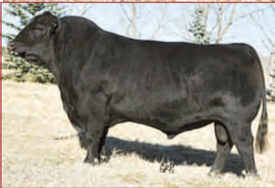
HF TIGER 5T SIRE OF LOT 20Y