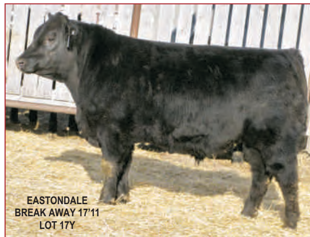
EASTONDALE BREAK AWAY 17'11 LOT 17Y