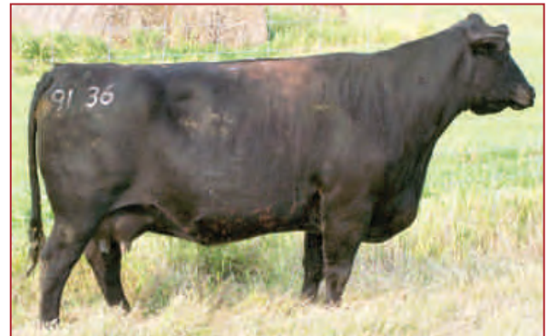
GDAR FOREVER LADY 9136 - DAM OF LOTS 20Y & 51Y