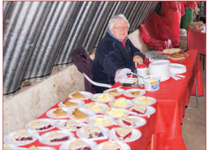
"YES GRANMAS PIES ARE BACK!"