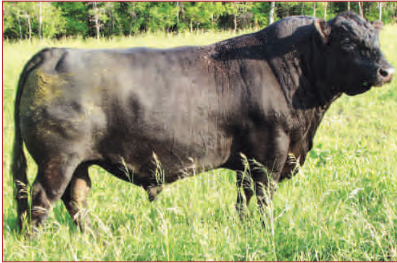
B HILLS FRL DURATION 606