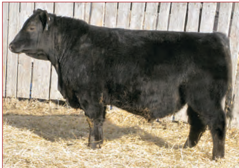
EASTONDALE VALUE 54'11 - LOT 54Y