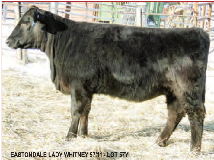
EASTONDALE LADY WHITNEY 57'11 - LOT 57Y

SITZ TRAVELER 8180 AMF NHF CAF LEACHMAN RIGHT TIME AMF SITZ ALLIANCE 6595 AMF NHF B HILLS FRL DURATION 606 SITZ BARBARAMERE JET 2698 H A BELETTA 0219 S: CU ALLIANCE 074U D: EASTONDALE LADY KARAMA 61'08 Q A S TRAVELER 23-4 AMF NHF CAF G D A R EXECUTIVE 727 AMF NHF C U HEROINE 537E FREYBURN LADY KARAMA 32M D N HEROINE 93 BAR 20 LADY KARAMA 351D