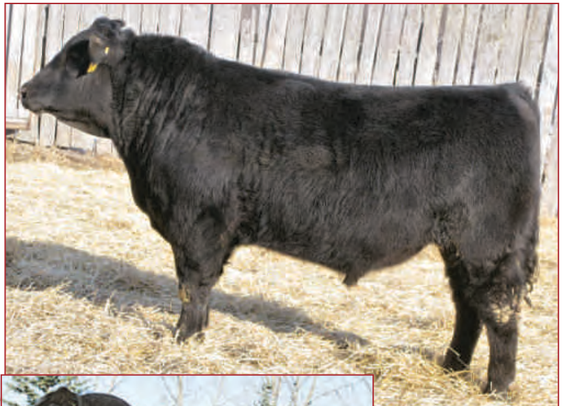
EASTONDALE ROAR 20'11 LOT 20Y