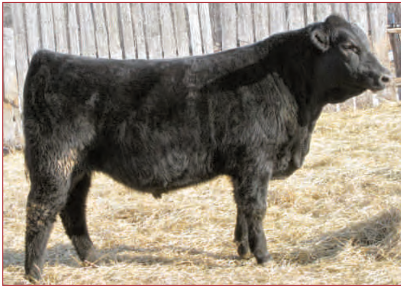
OAKWOOD RIGHT TIME 1Y - LOT 1Y