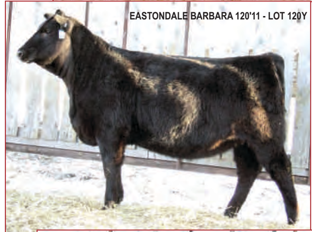
EASTONDALE BARBARA 120'11 - LOT 120Y